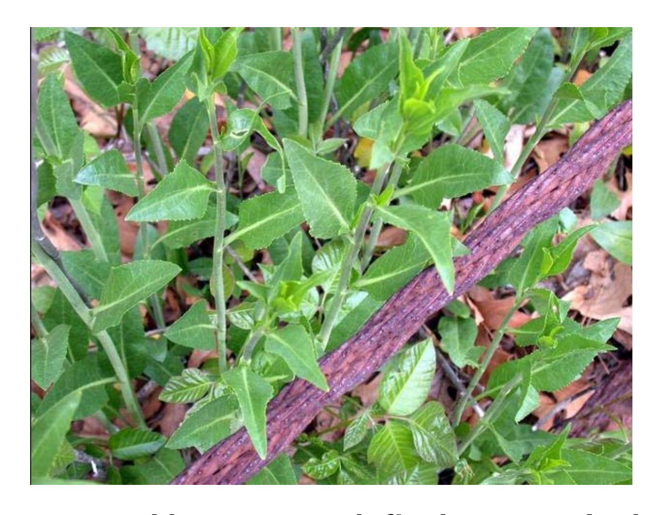
Pepperweed has a smooth fleshy stem. At the mature stage, its leaves can have either smooth or finely serrated edges.