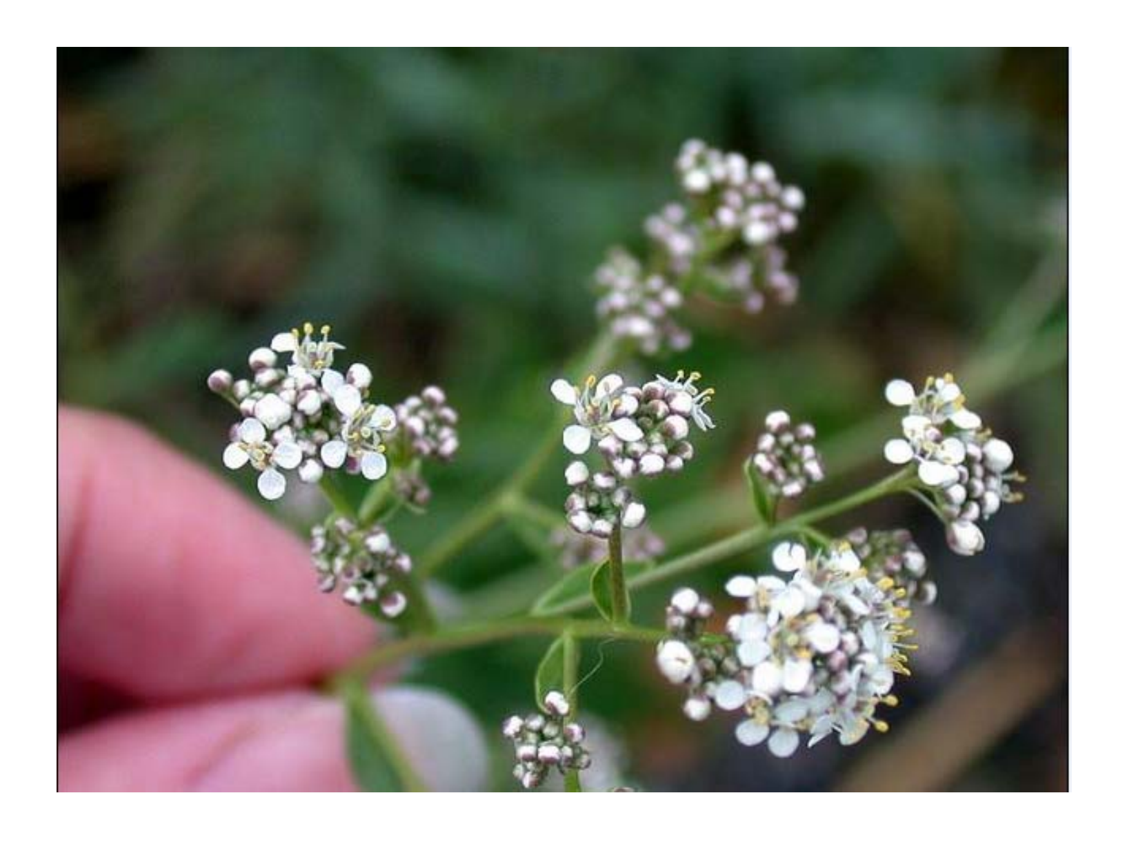
Each pepperweed flower has four spoon-shaped petals.