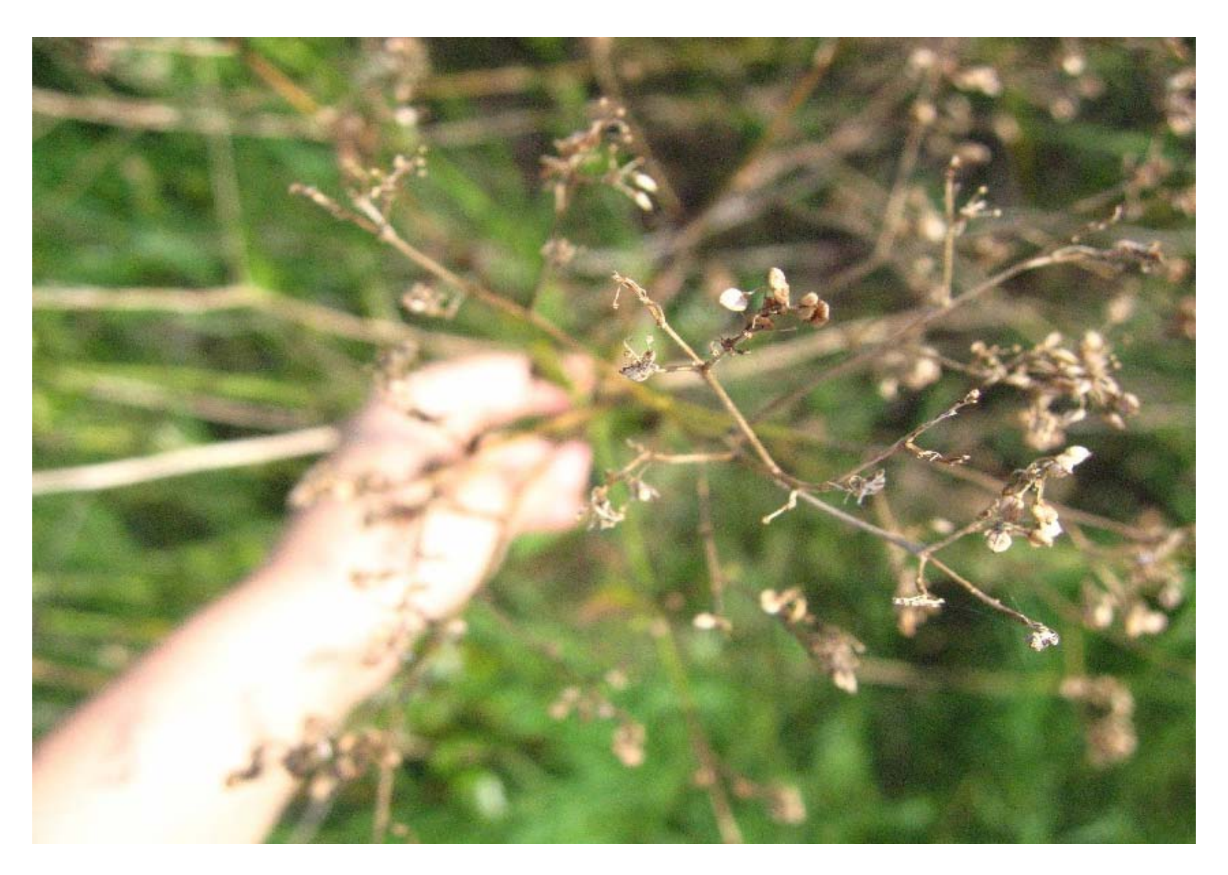
After pepperweed goes to seed in late July and early August, its flowers brown and wither.