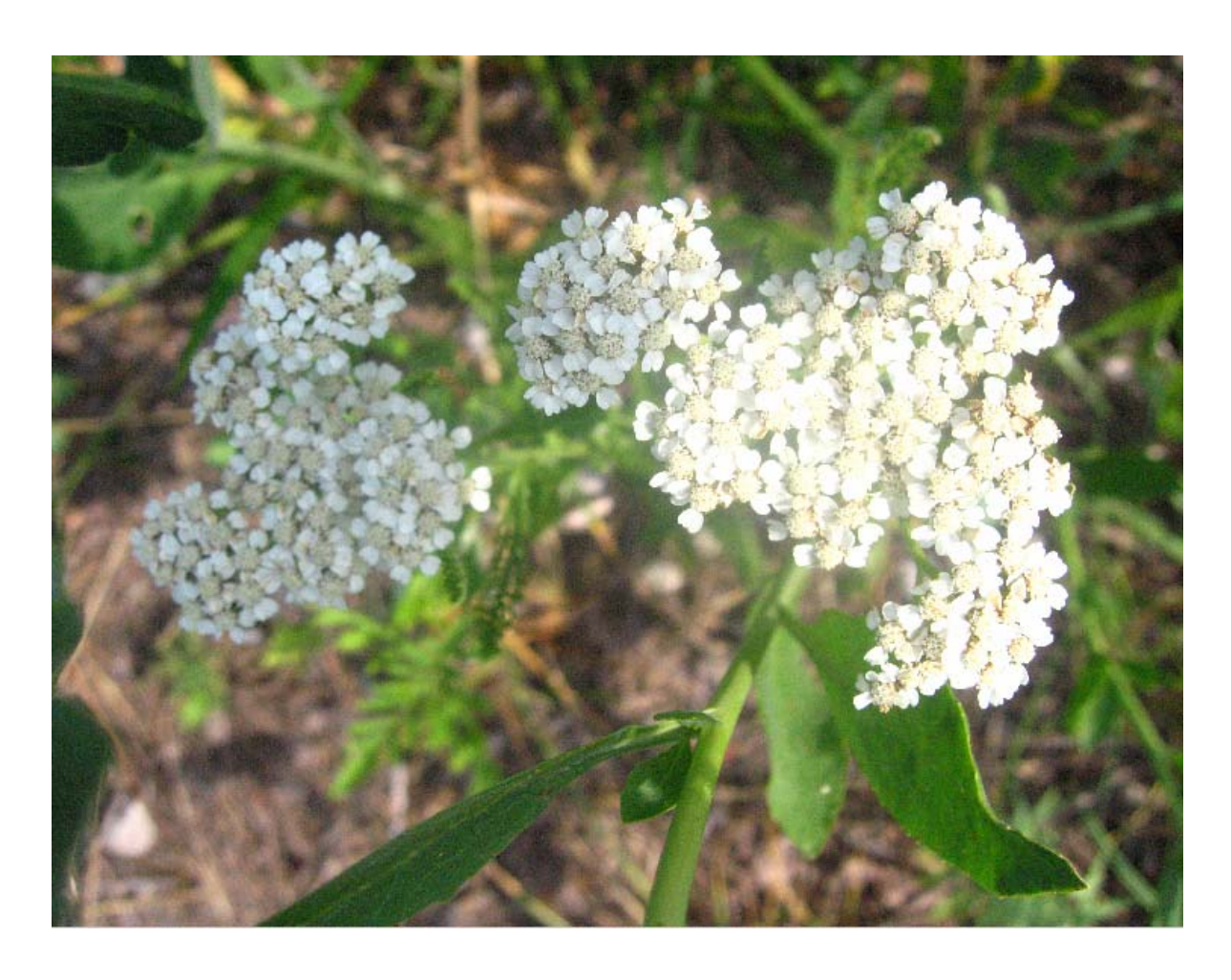
Pepperweed flowers in July, producing small white flowers in dense clusters.