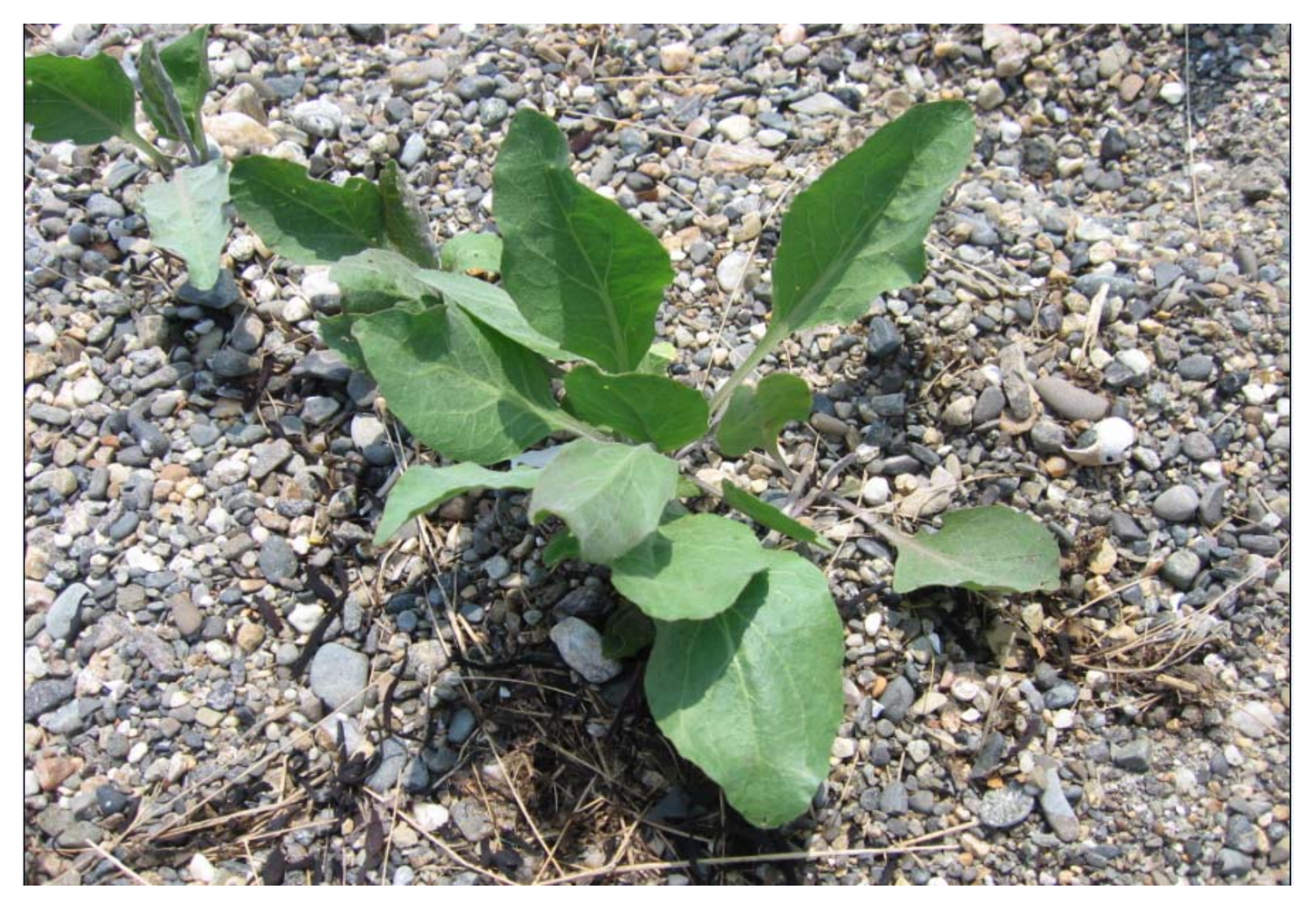
Pepperweed begins as a rosette low to the ground. It begins growing in May. At this juvenile stage, its serrated leaves are about 6" long and 2" wide.