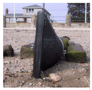
#620 – Juniper Beach, Salem

In 2006, the Juniper Beach outfall (#620) started off the sampling season with the same record high numbers as in the past (16,740 CFU/100mL). But after the Salem DPW cleaned the pipe and installed a